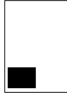
1/8 Page 2.4" x 1.865"

— clip here and return entire lower portion with order —