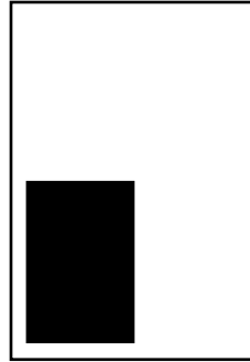
1/4 Page 2.4" x 3.92"